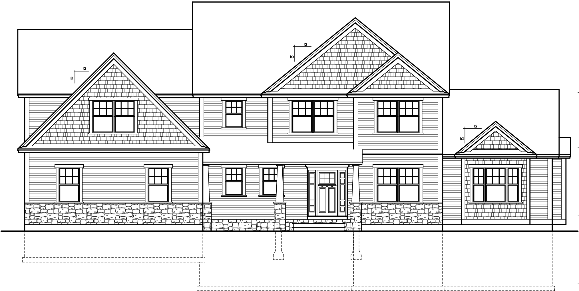
1 FRONT ELEVATION AI SCALE: 1/4" = 1'-0"