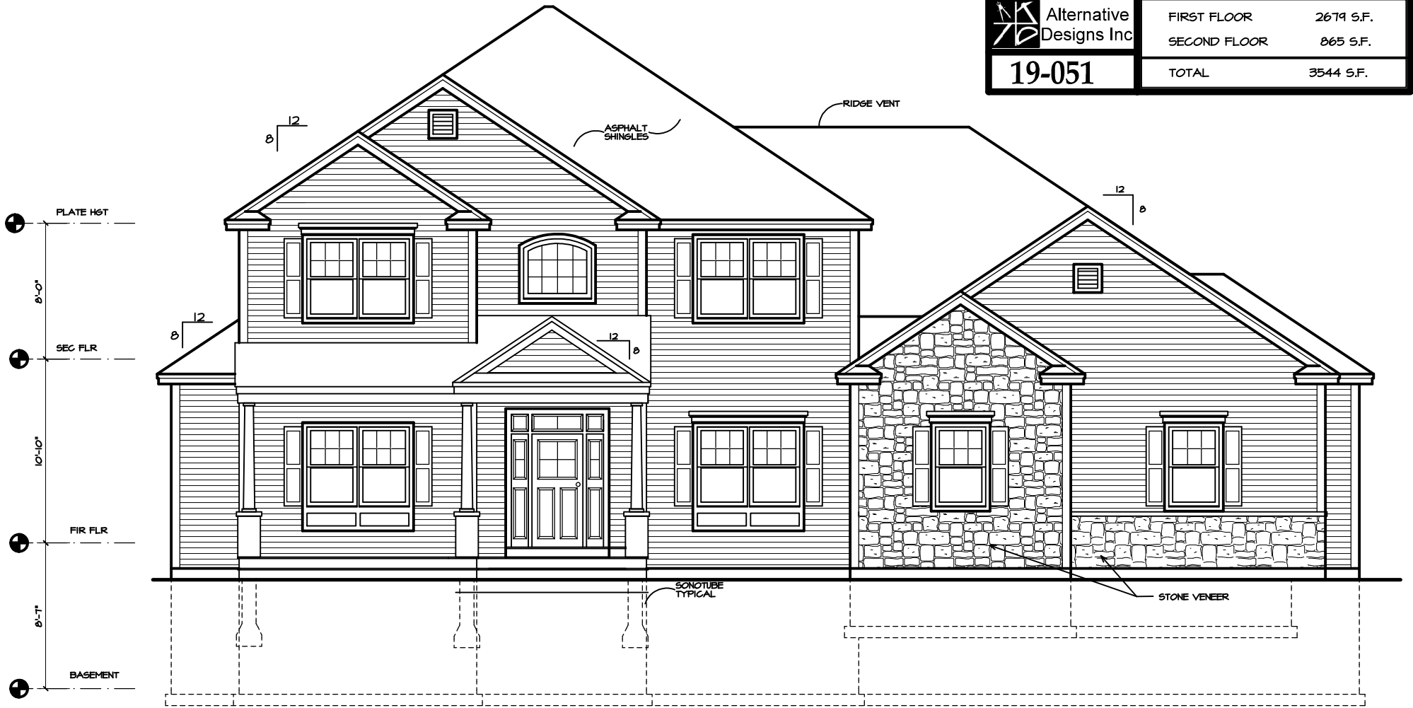
1 FRONT ELEVATION AI SCALE: 1/4" = 1'-0"